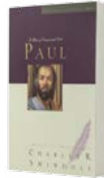
Paul: A Man of Grace and Grit by Charles R. Swindoll softcover book

For these and related resources, visit www.insightworld.org/store or call USA 1-800-772-8888 • AUSTRALIA +61 3 9762 6613 • CANADA 1-800-663-7639 • UK +44 1306 640156