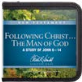
Following Christ . . . The Man of God: A Study of John 6–14 by Charles R. Swindoll CD series