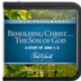
Beholding Christ . . . The Son of God: A Study of John 1–5 by Charles R. Swindoll CD series