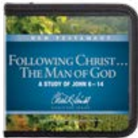
Following Christ . . . The Man of God: A Study of John 6–14 by Charles R. Swindoll CD series