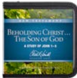
Beholding Christ . . . The Son of God: A Study of John 1–5 by Charles R. Swindoll CD series