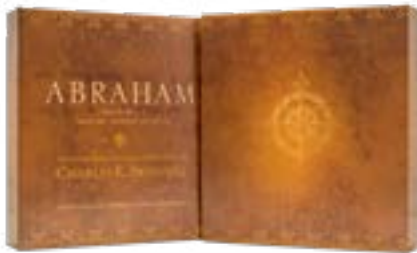
Abraham: One Nomad's Amazing Journey of Faith by Charles R. Swindoll Classic CD series