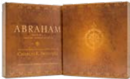
Abraham: One Nomad's Amazing Journey of Faith by Charles R. Swindoll Classic CD series