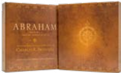
Abraham: One Nomad's Amazing Journey of Faith by Charles R. Swindoll Classic CD series