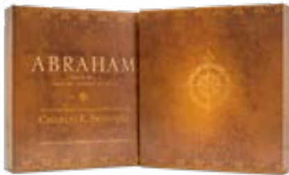
Abraham: One Nomad's Amazing Journey of Faith by Charles R. Swindoll Classic CD series