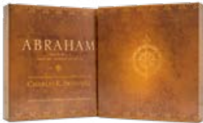
Abraham: One Nomad's Amazing Journey of Faith by Charles R. Swindoll Classic CD series