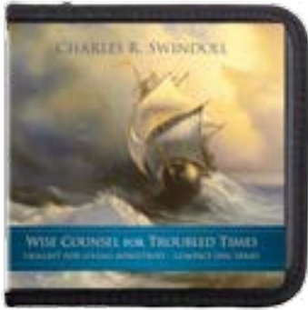
Wise Counsel for Troubled Times by Charles R. Swindoll CD series