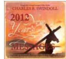
2012 New Year's Messages by Charles R. Swindoll CD set of 2 CDs