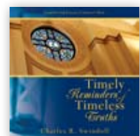
Timely Reminders of Timeless Truths by Charles R. Swindoll compact disc

To order any of these related resources, call 0800-915-9364 or visit www.insightforliving.org.uk