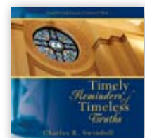
Timely Reminders of Timeless Truths by Charles R. Swindoll compact disc

To order any of these related resources, call 0800-915-9364 or visit www.insightforliving.org.uk