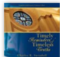
Timely Reminders of Timeless Truths by Charles R. Swindoll compact disc

To order any of these related resources, call 0800-915-9364 or visit www.insightforliving.org.uk