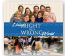
Living Right in a Wrong World by Charles R. Swindoll compact disc series