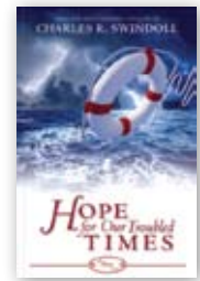
Hope for Our Troubled Times by Insight for Living paperback book