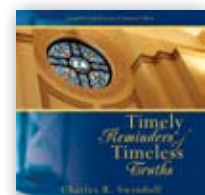
Timely Reminders of Timeless Truths by Charles R. Swindoll compact disc

To order any of these related resources, call 0800-915-9364 or visit www.insightforliving.org.uk