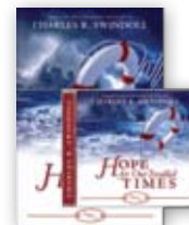
Hope for Our Troubled Times by Charles R. Swindoll compact disc series and softcover book