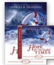
Hope for Our Troubled Times by Charles R. Swindoll compact disc series and softcover book