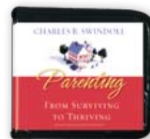
Parenting: From Surviving to Thriving by Charles R. Swindoll compact disc series