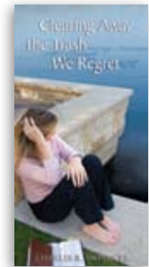
Clearing Away the Trash We Regret by Charles R. Swindoll booklet