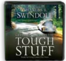
Getting Through the Tough Stuff It's Always Something! by Charles R. Swindoll CD series