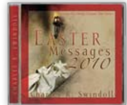
Easter Messages 2010 by Charles R. Swindoll CD set