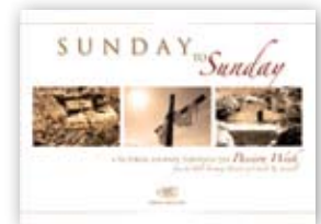
Sunday to Sunday: A Pictorial Journey Through the Passion Week by Charles R. Swindoll and Insight for Living paperback book