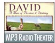
David: A Man of Passion & Destiny, Part 1 MP3 Radio Theater by Insight for Living download only

To order any of these related resources, call 0800-915-9364 or visit www.insightforliving.org.uk