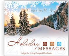
Holiday Messages 2009 by Charles R. Swindoll CD series