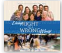
Living Right in a Wrong World by Charles R. Swindoll compact disc series