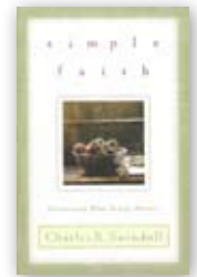
Simple Faith: Discovering What Really Matters by Charles R. Swindoll softcover book