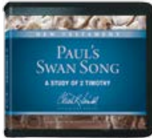
Paul's Swan Song: A Study of 2 Timothy by Charles R. Swindoll and Insight for Living Ministries CD series