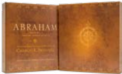
Abraham: One Nomad's Amazing Journey of Faith by Charles R. Swindoll Classic CD series