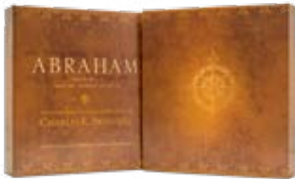
Abraham: One Nomad's Amazing Journey of Faith by Charles R. Swindoll Classic CD series