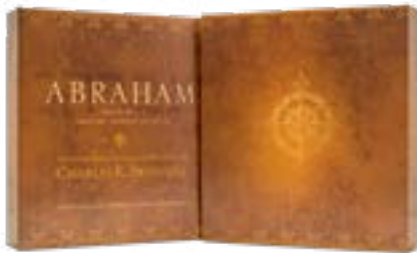
Abraham: One Nomad's Amazing Journey of Faith by Charles R. Swindoll Classic CD series