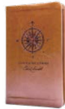
Faith for the Journey: Daily Meditations on Courageous Trust in God by Charles R. Swindoll LeatherLike book

For these and related resources, visit www.insightworld.org/store or call USA 1-800-772-8888 • AUSTRALIA +61 3 9762 6613 • CANADA 1-800-663-7639 • UK +44 1306 640156