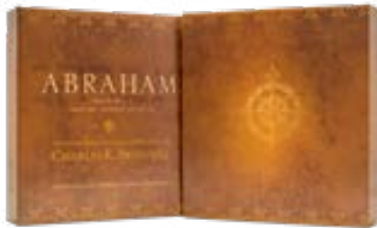
Abraham: One Nomad's Amazing Journey of Faith by Charles R. Swindoll Classic CD series