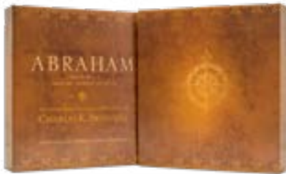
Abraham: One Nomad's Amazing Journey of Faith by Charles R. Swindoll Classic CD series